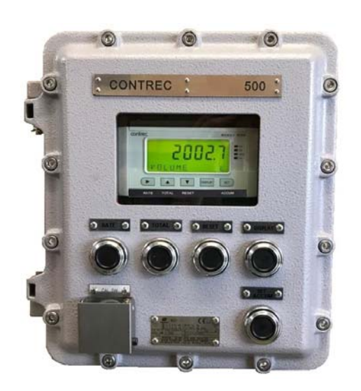
Example of 500 Series in BZC Ex d enclosure